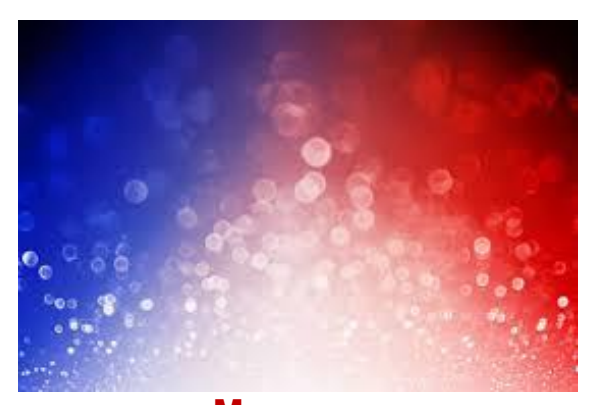
Message: 'The God I Know'