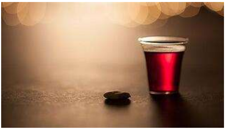
Message: 'Entering Into God's Rest'