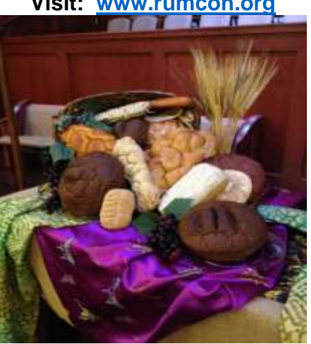
Series: 'What if...' Message:

'What if...we humble ourselves and pray?'