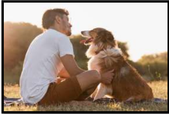
Message "My Dog Gets It!"