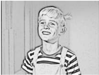
“Just Plain Old Dennis”

8:30am & 10:30am Services visit www.rumcoh.org